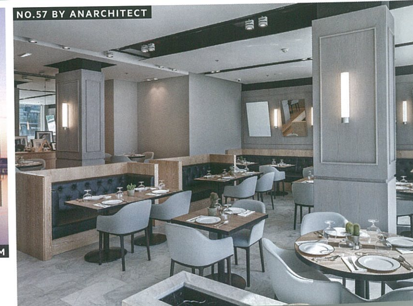
NO.57 BY ANARCHITECT