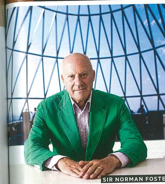
SIR NORMAN FOSTER