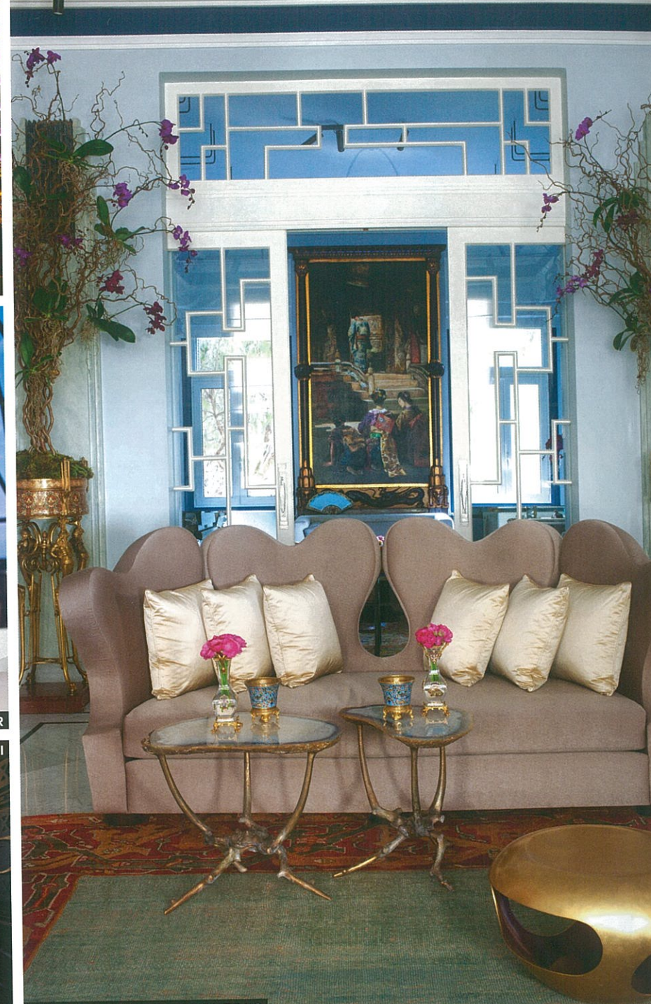
RESIDENCE BY RAMY BOUTROS