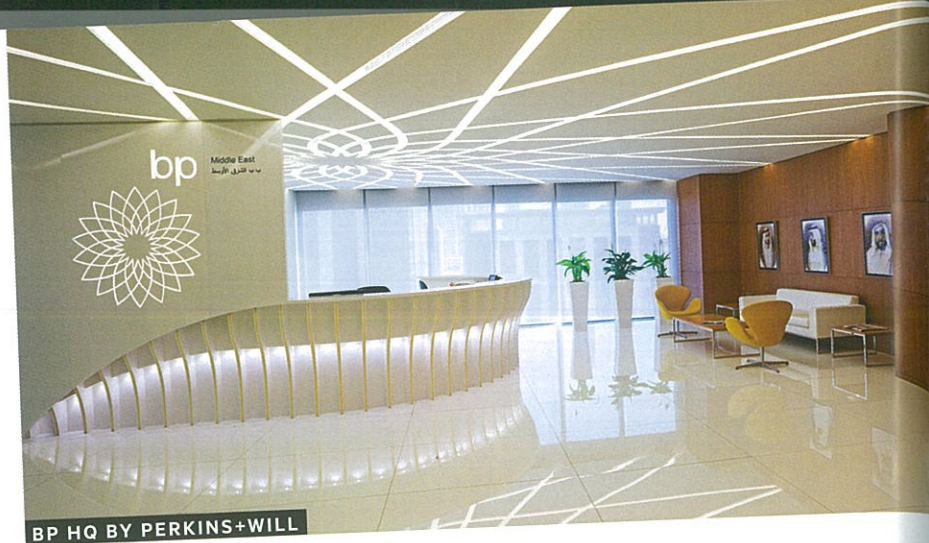
BP HQ BY PERKINS+WILL