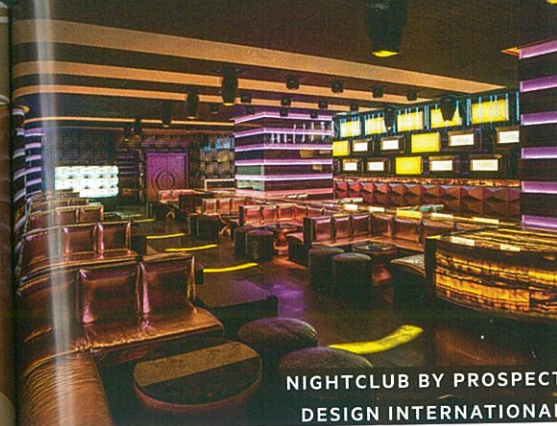
NIGHTCLUB BY PROSPECT DESIGN INTERNATIONAL